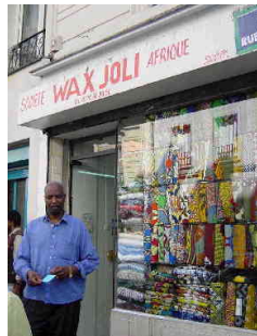
Société Wax Joli Afrique 30, rue Poulet 75018 Paris 01 42 58 98 96