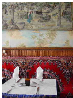
Restaurant le Nioumre Sénégal-Africain 7 rue des Poissonniers 75018 Paris Metro: Chateau-Rouge or Barbès Telephone 01 42 51 24 94 Closed Monday