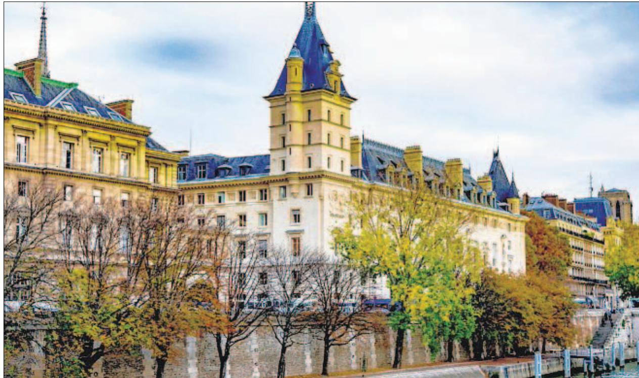
A view along the River Seine in Paris, France

When in the La Marais neighborhood, the oldest Jewish area in Paris, we did notice heavy security at a Jewish Synagogue, all to be expected. While